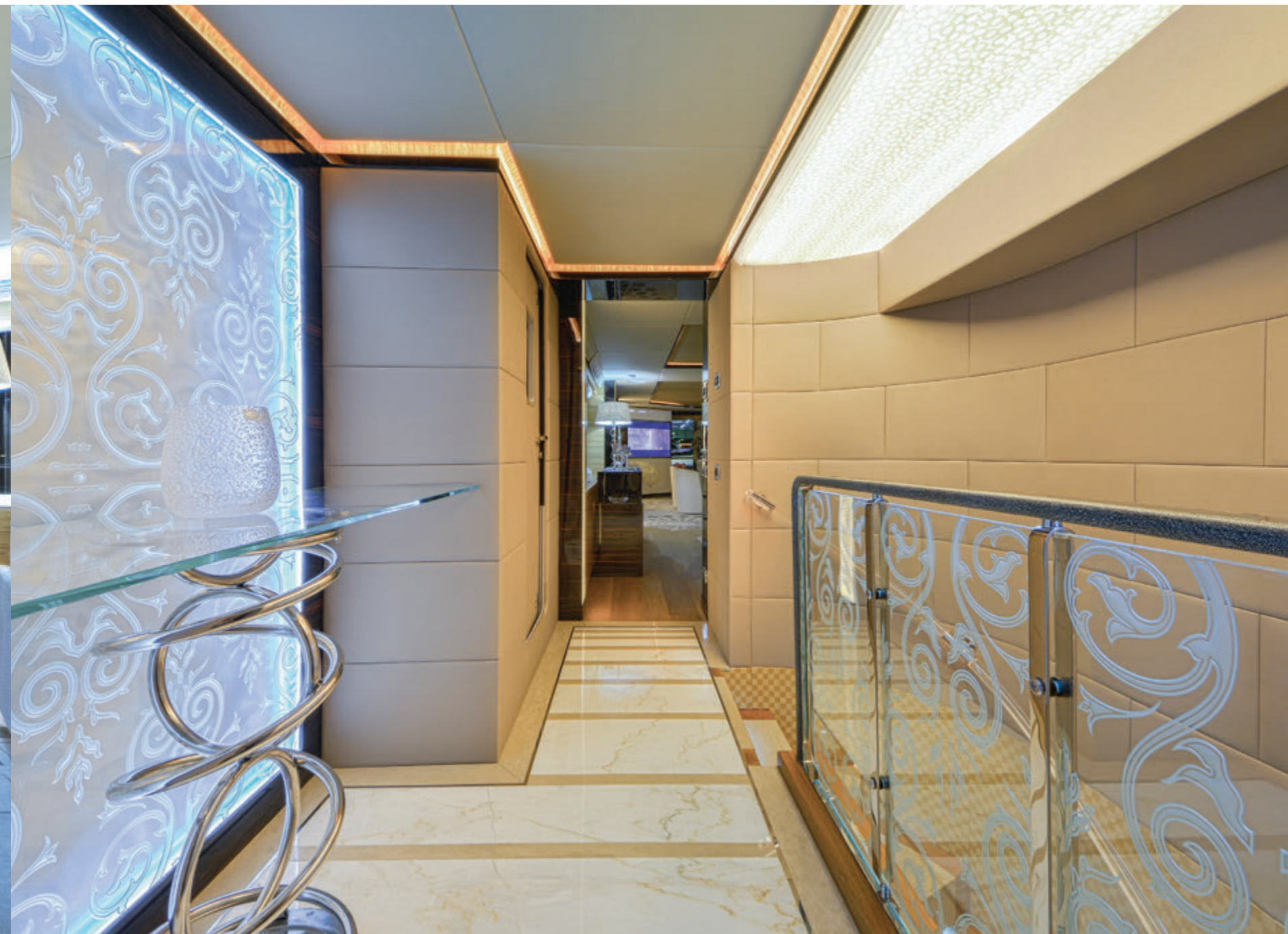
Main Deck Lobby

The striking Majesty 122 is a 37m superyacht that exudes style, class and modernity. This eye-catching superyacht is perfectly designed for relaxing holidays and entertaining thanks to its generous spaces for relaxing, socialising and enjoying a seagoing lifestyle.