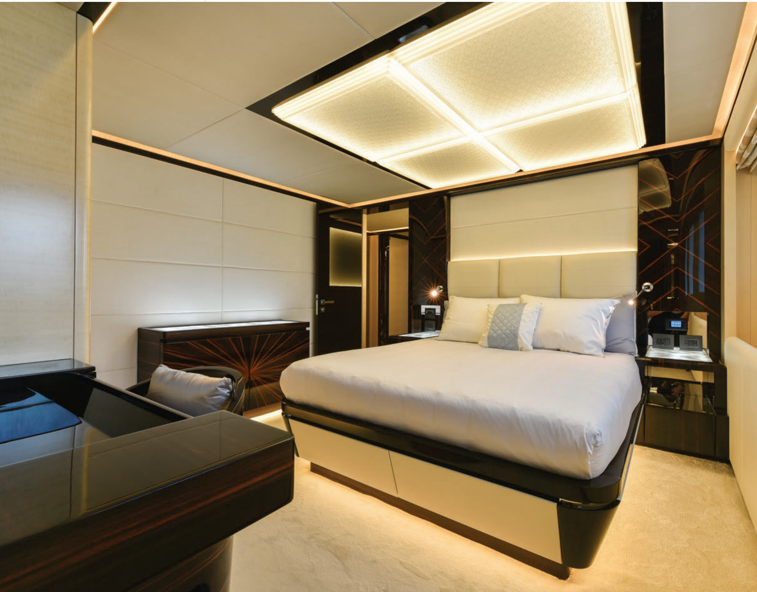
Double Guest Stateroom