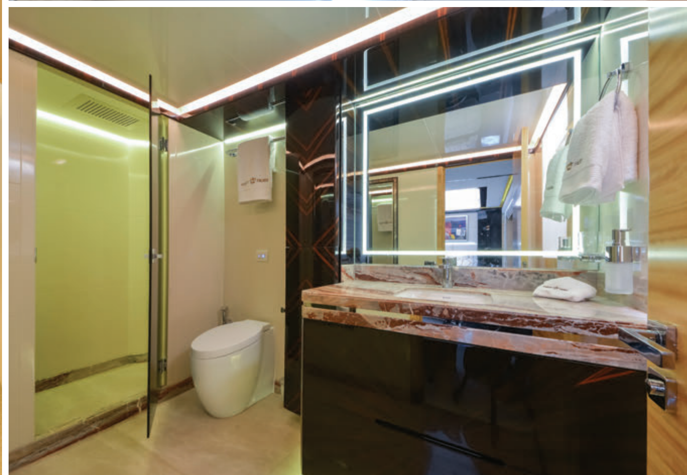
Top. Twin Guest Stateroom | Bottom. Double Guest En Suite