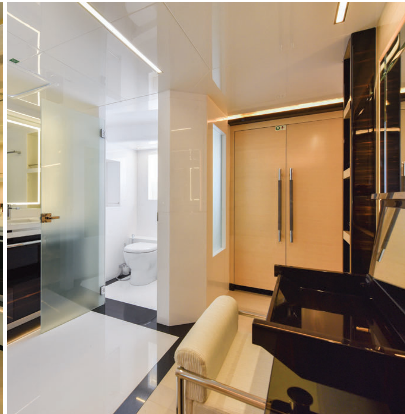
Owner's En Suite

This sleek superyacht features a owner's stateroom, two double staterooms and two twin staterooms, which can accommodate up to 12 guests and five crew members.