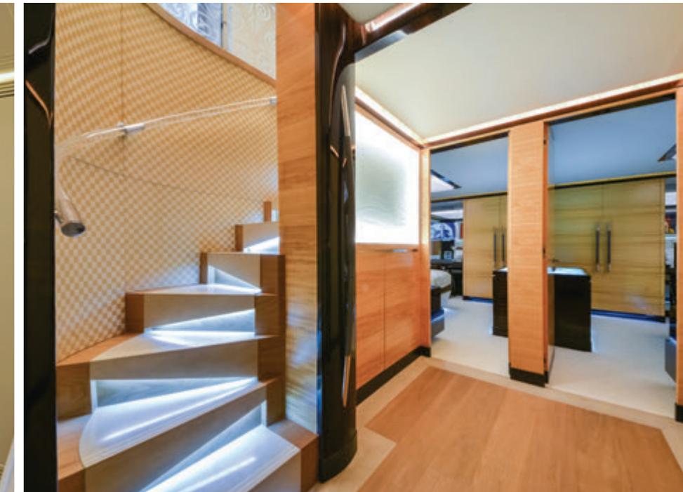
Lower Deck Lobby

The Majesty 122 uses sophisticated technology throughout to ensure that every operation runs smoothly, complete with ultra-modern entertainment systems on every deck.