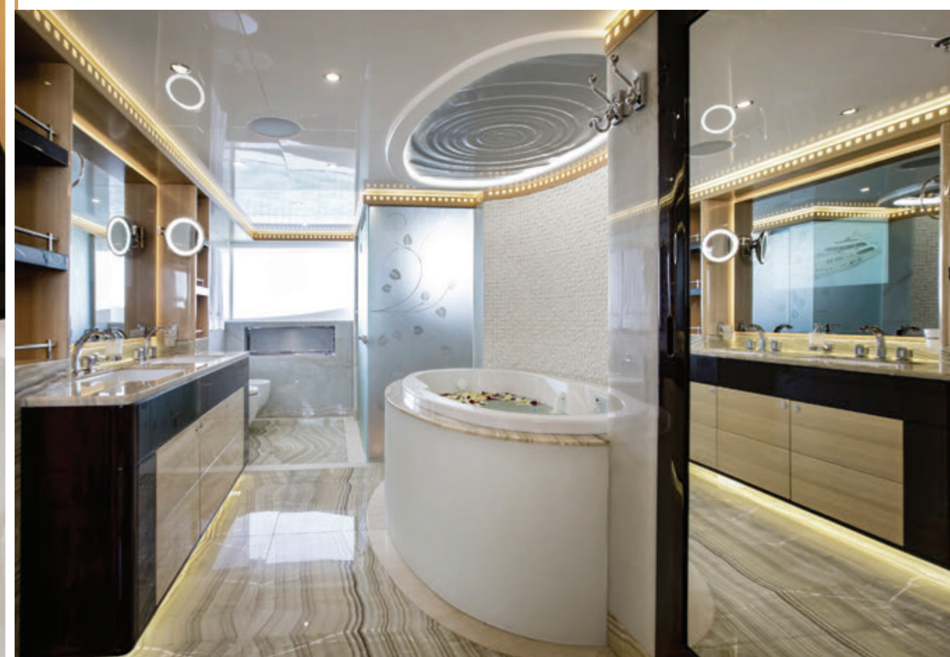
Top. Owner's Seating | Bottom. Owner's En Suite