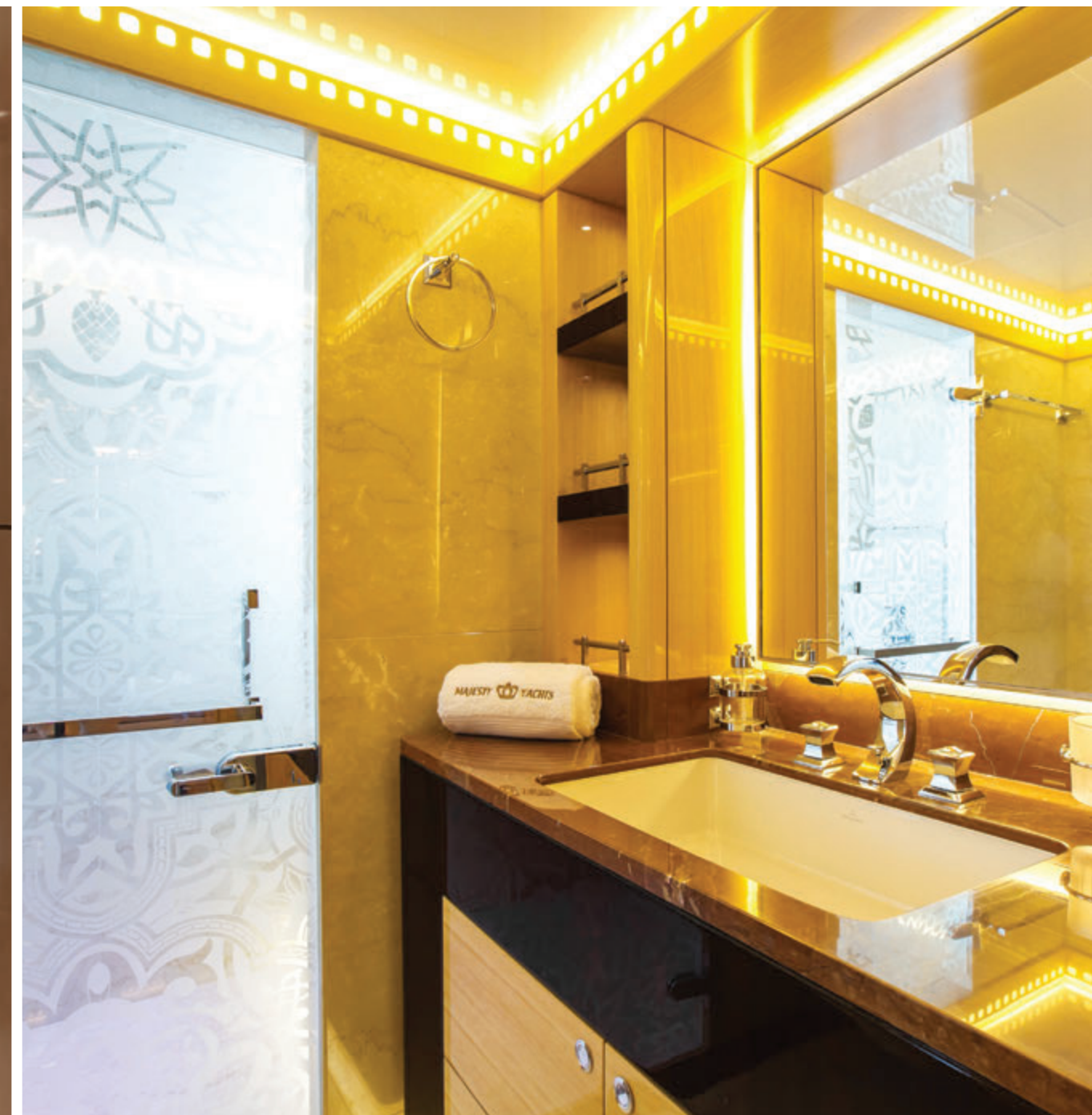
Twin Guest En Suite