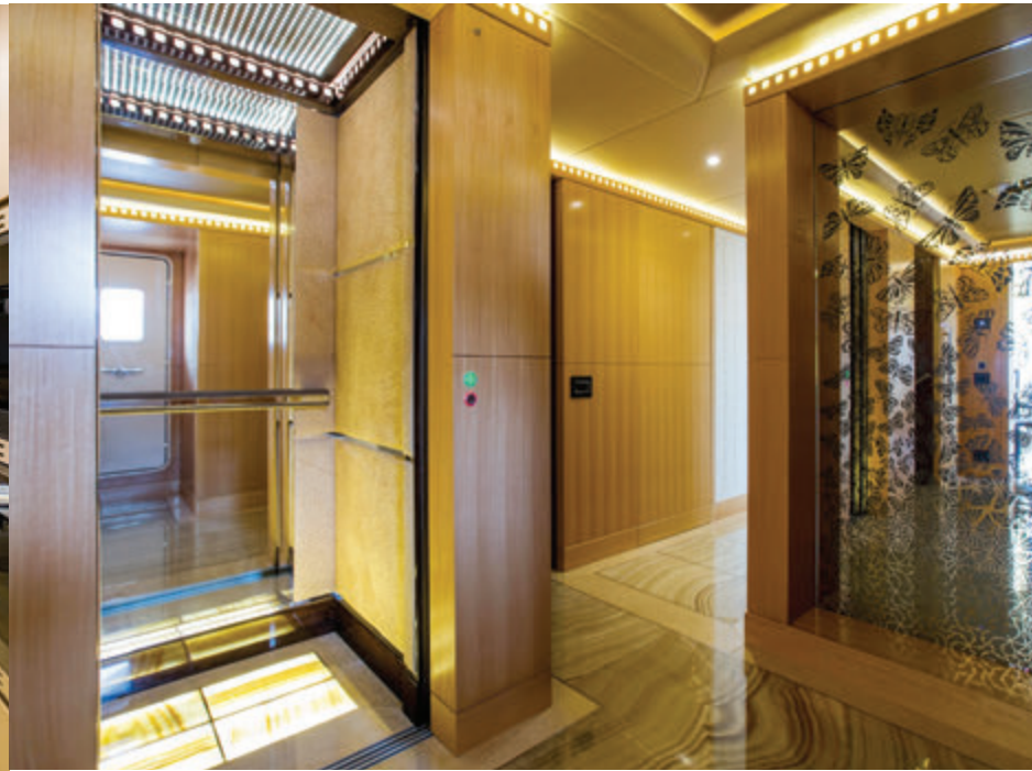
Main Lobby - Elevator