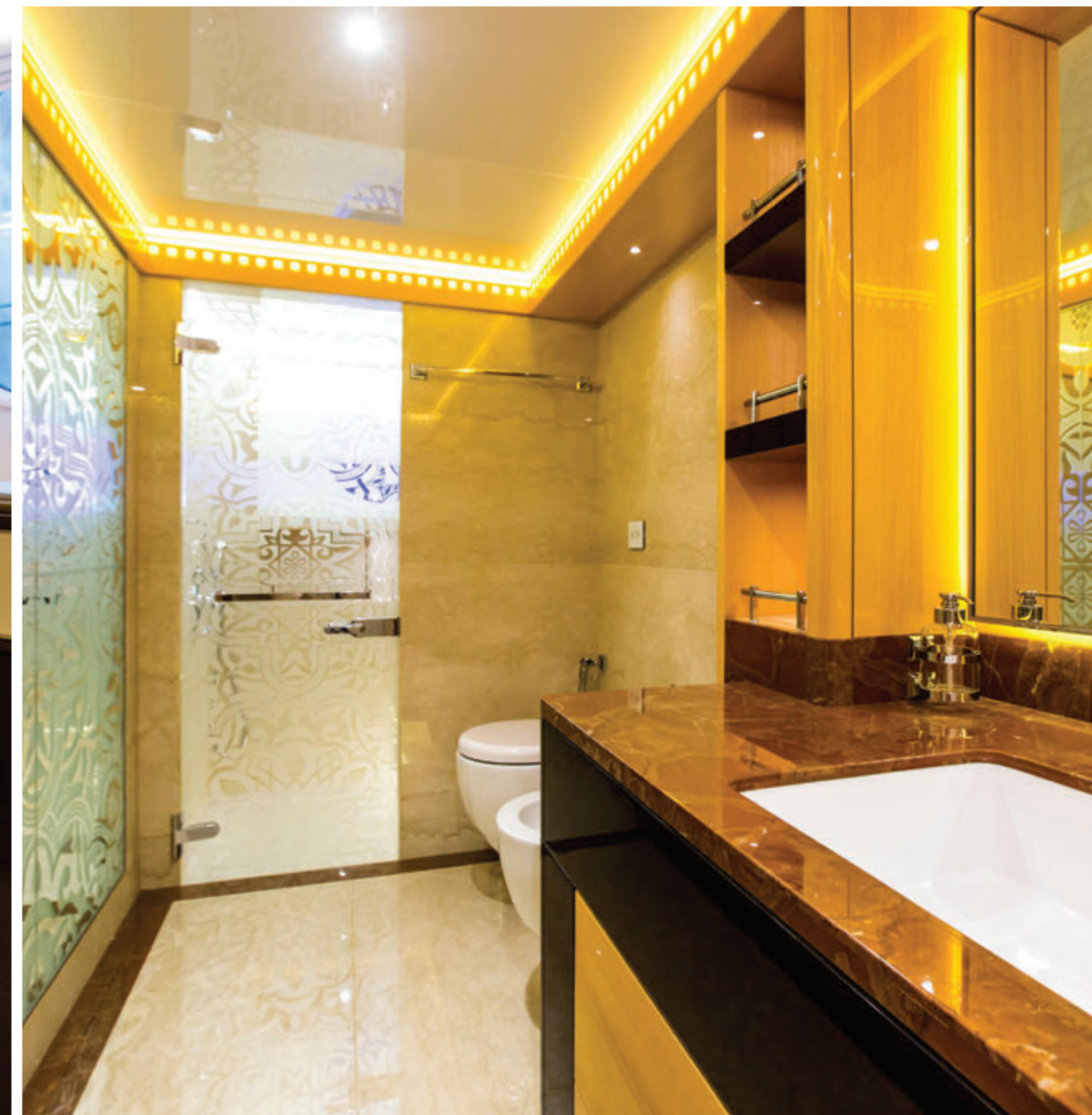
Double Guest En Suite

The 47m superyacht Majesty 155 offers unequivocal luxury. With through at its six expansive staterooms. While an elevator that carries guests between the lower, main, and upper decks offers added onboard convenience.