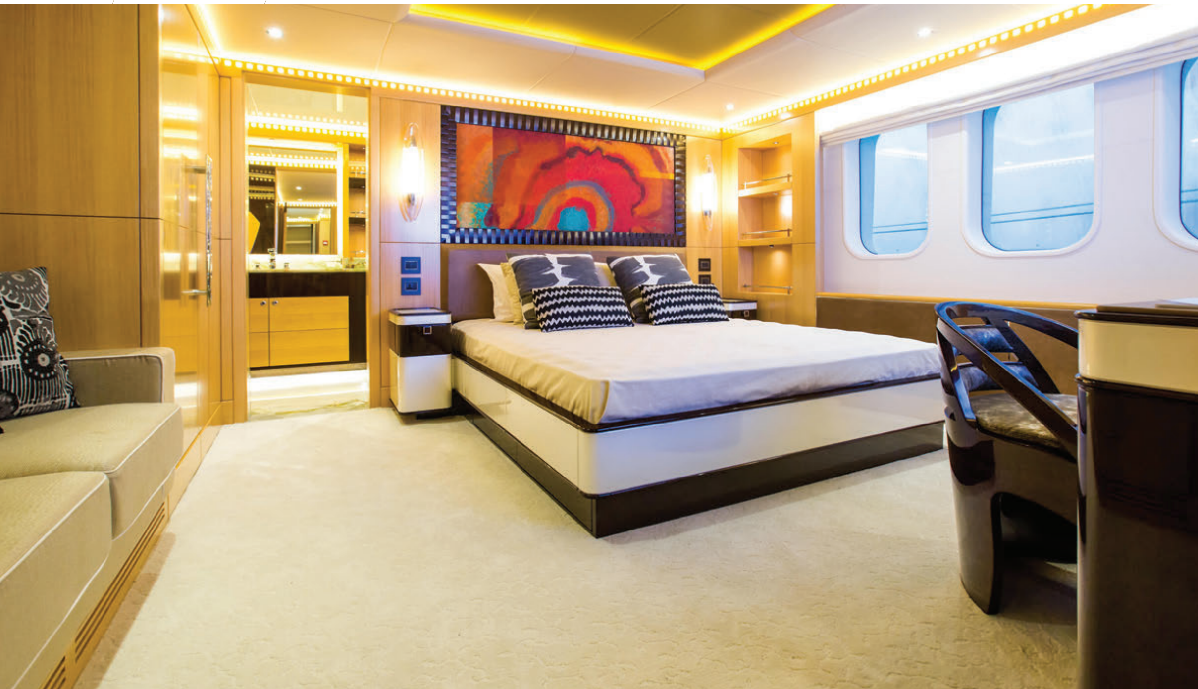
Double Guest Stateroom