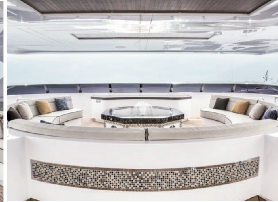
Sun Deck Seating