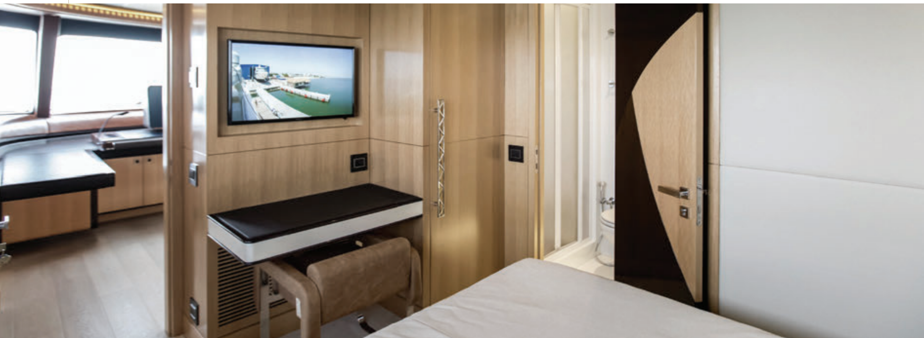
Top. Upper Deck Saloon | Bottom. Captain's Cabin