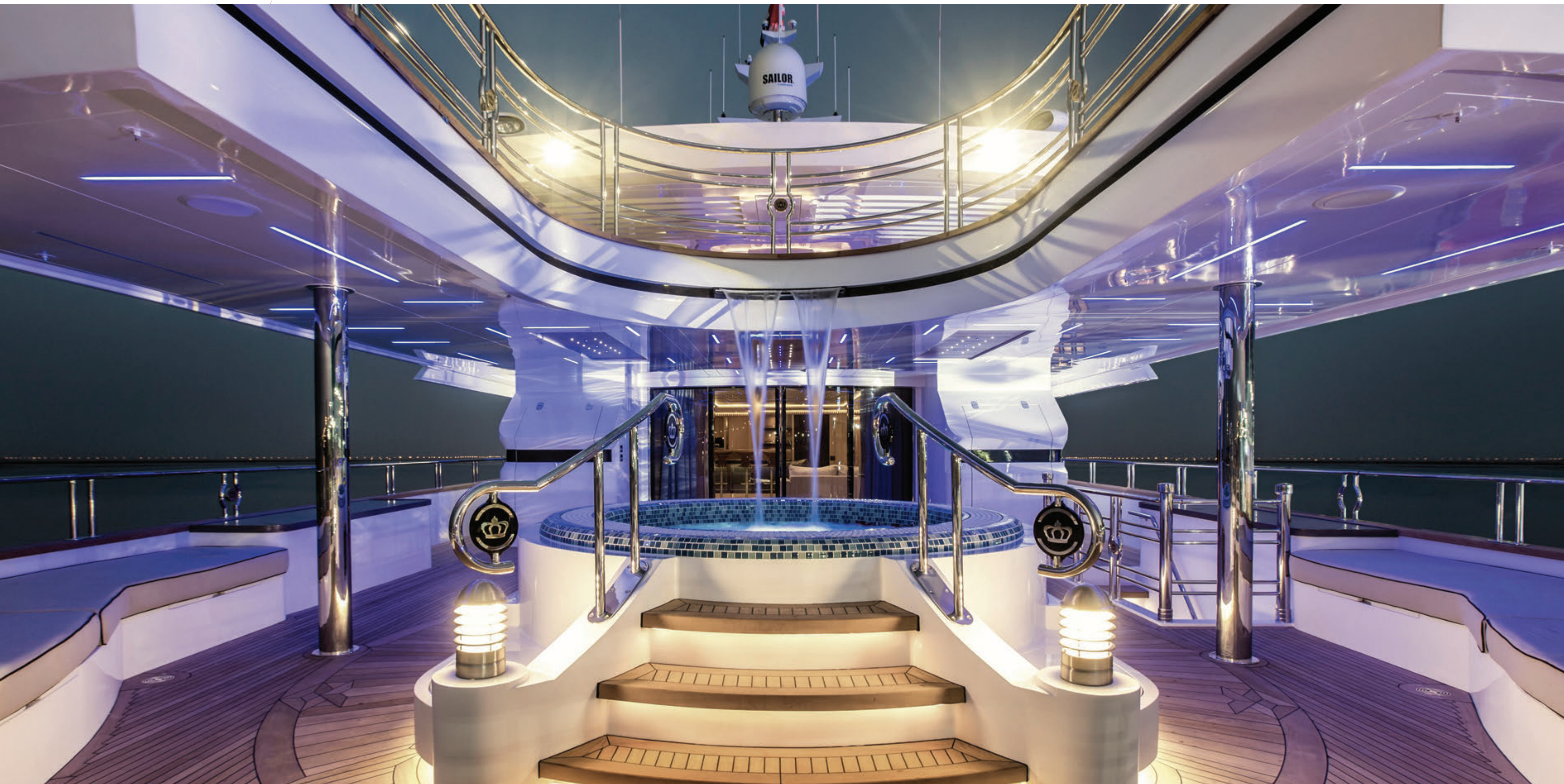
Upper Deck Waterfall