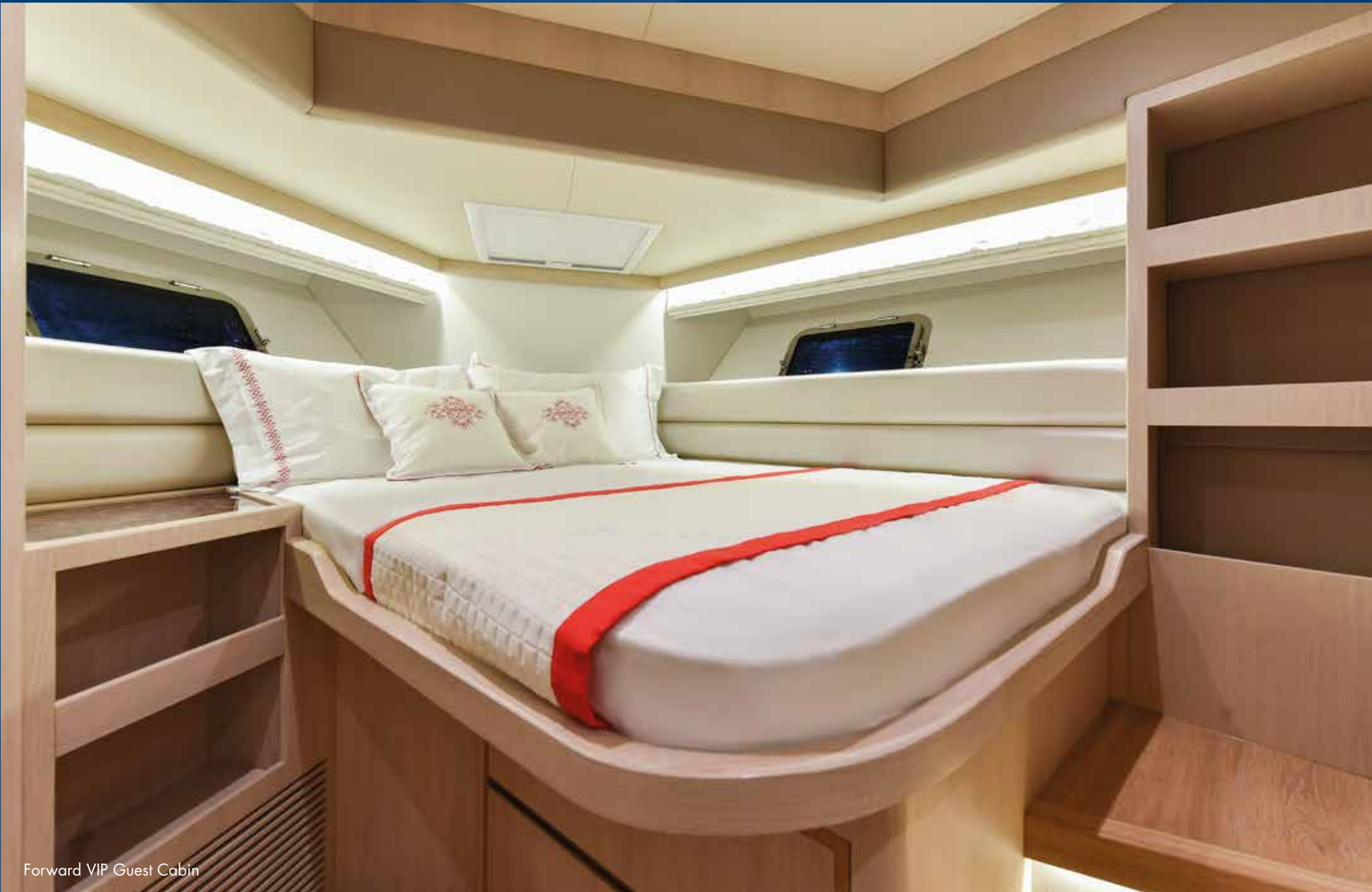
Forward VIP Guest Cabin