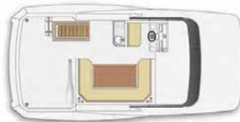
FLY-BRIDGE OPTION 2