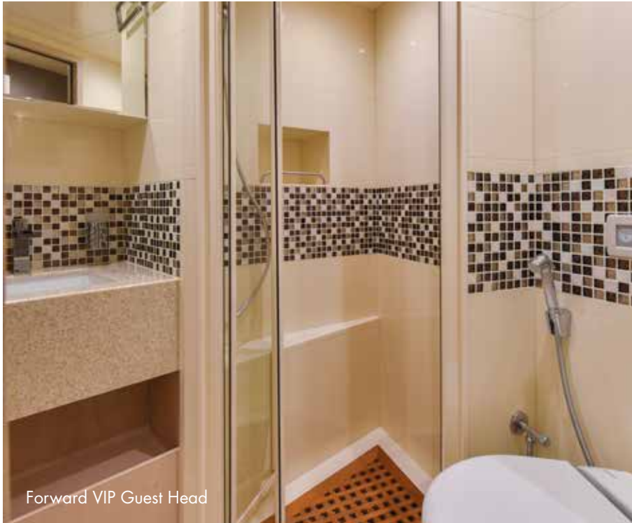
Forward VIP Guest Head