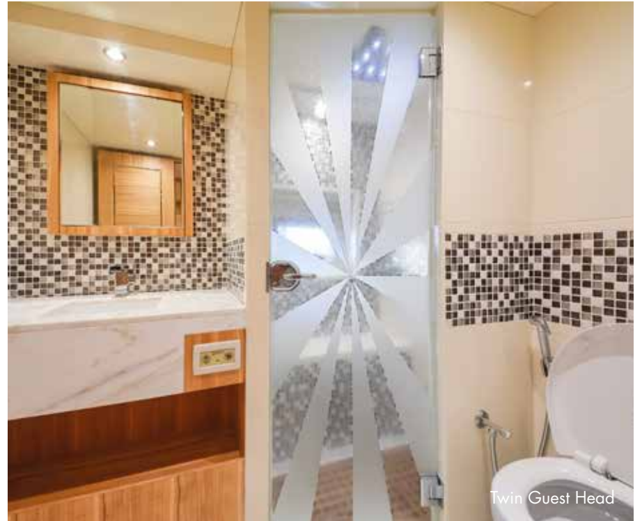
Twin Guest Head