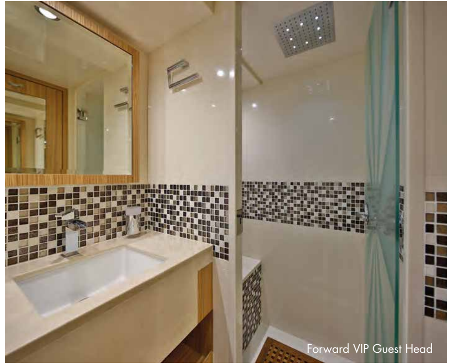
Forward VIP Guest Head