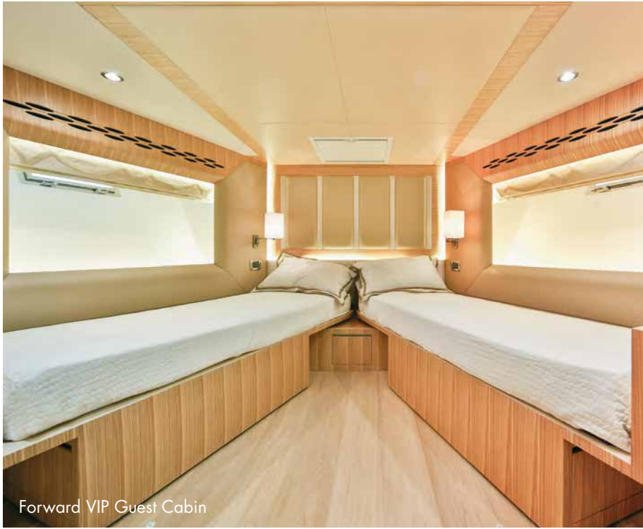
Forward VIP Guest Cabin