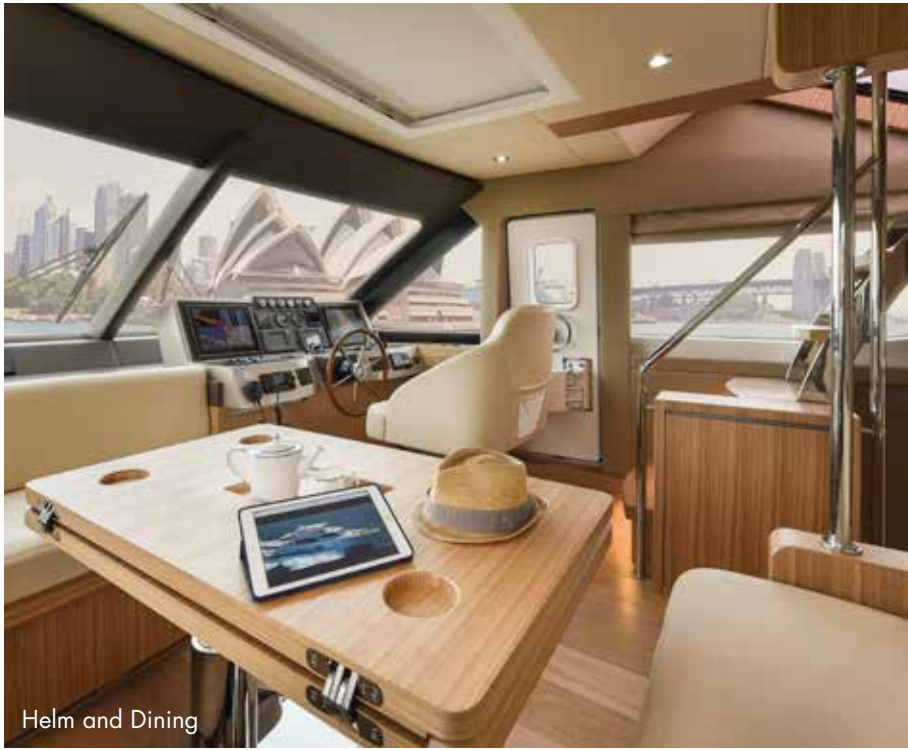
Helm and Dining