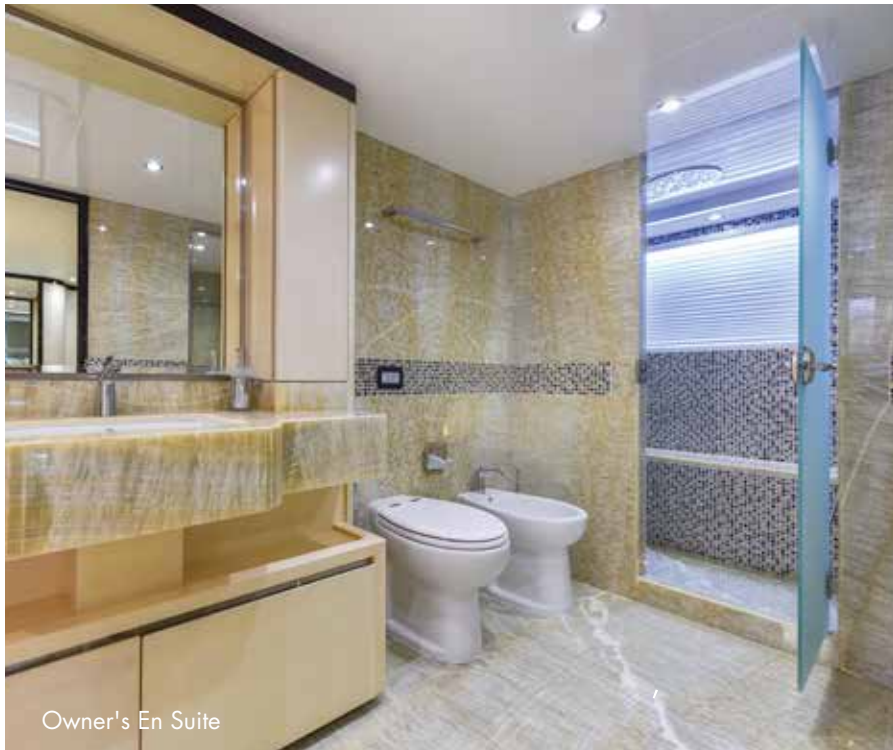
Owner's En Suite