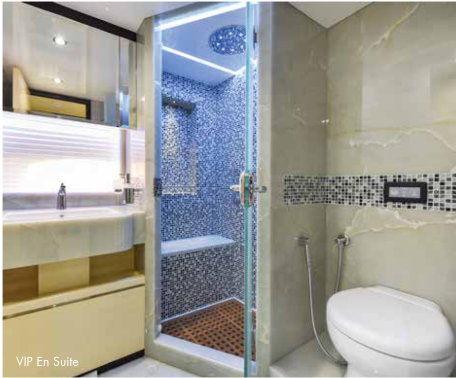
VIP En Suite