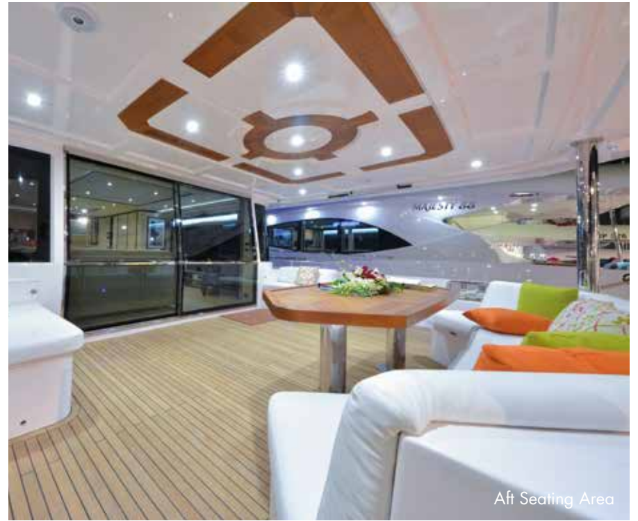
Aft Seating Area