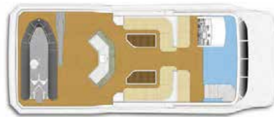
FLY-BRIDGE OPTION 2